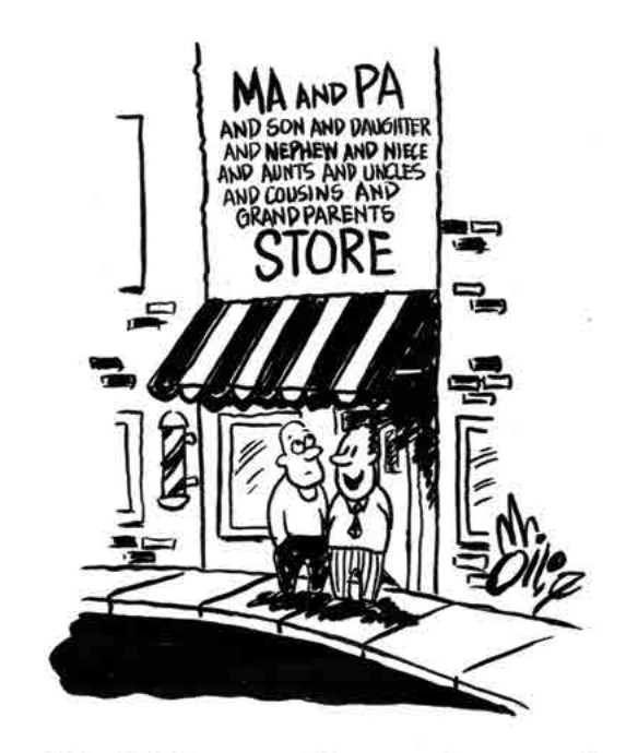
"Ma didn't want to leave out anyone."